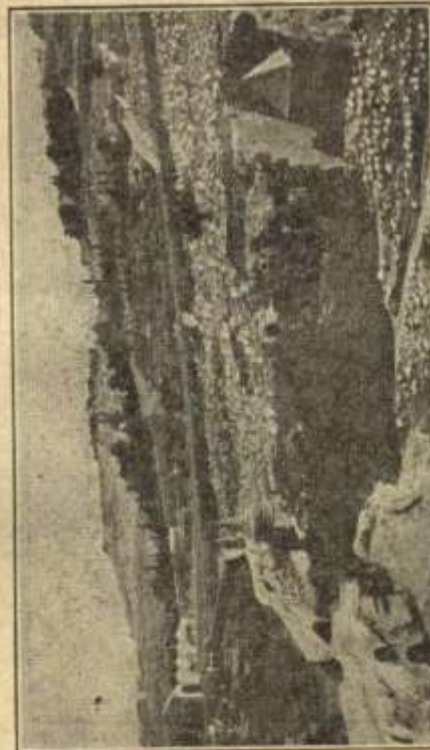
OLD TOMBS NEAR THE GARDEN OF GETHSEMANE