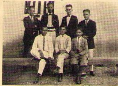
REPRESENTING SIX COUNTRIES

The boys quarry rock, run it through the crusher, mix cement, and fill the forms. They do all the carpentry work and cultivate the farm. The concrete buildings rising on different parts of the campus are the work of their hands. Two hours daily labor is a part of their education.