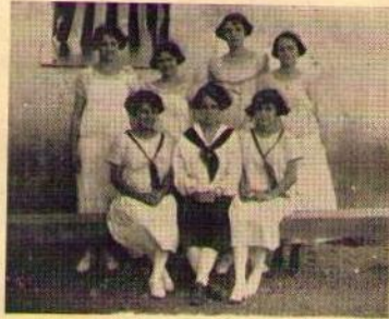
TYPICAL INSTITUTE GIRLS

The girls cook, serve tables, wash, iron, and do a great variety of other work directed toward practical ends. Thus the expenses of the school are reduced and the hardy characters of the girls develop with the growth of this Christian Institution.